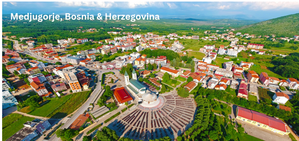
Medjugorje, Bosnia & Herzegovina