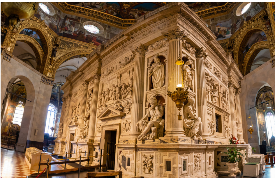
Loreto, Italy - House Of The Holy Family