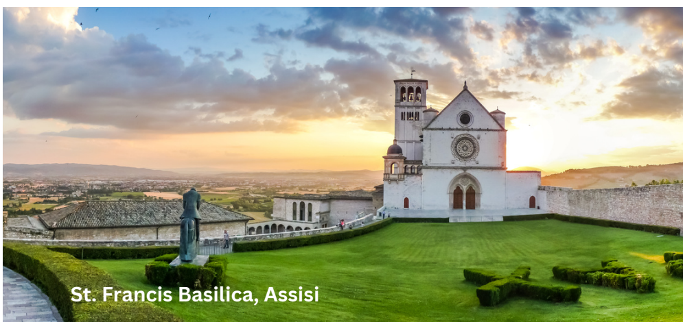
St. Francis Basilica, Assisi

This early morning after a good night's rest and breakfast, we will have a sightseeing tour of Assisi, the City of Peace, St. Francis, and St. Claire . The group will be learning about St. Francis and his life. Your walking guided tour will start at the church of Santa Chiara, where you will see The Cross that spoke to St. Francis and pray his prayer before the same Crucifix. The group will learn more about St. Claire, the founder of Poor Clair's, and see her incorrupt body. The visit will also include the crypt with the tomb of St. Francis in the basilica dedicated to the saint. Our tour of the City of Peace will end with " Porziuncola ," one of three restored churches of young Francis that is currently inside the Basilica of St. Mary of the Angels . After a guided tour of the City of Peace , leisure time until dinner at our hotel! Second night in Assisi.