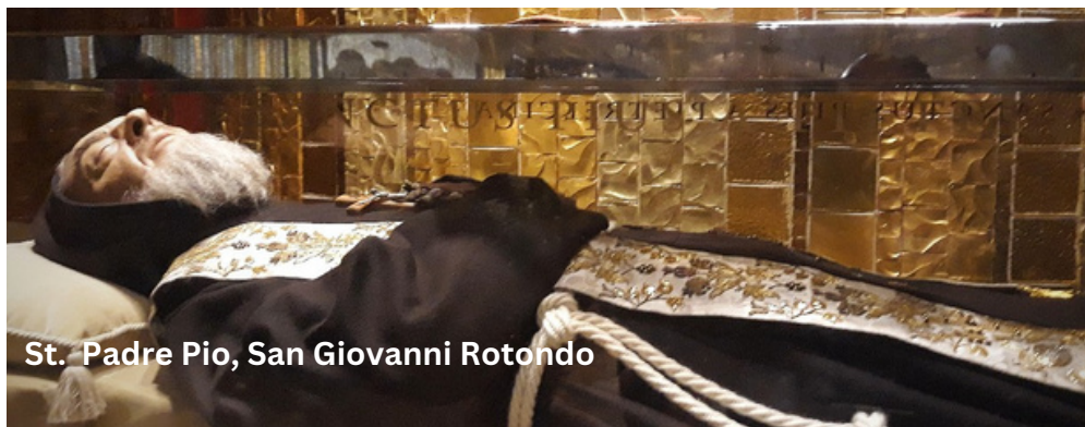
St. Padre Pio, San Giovanni Rotondo

After breakfast, we will leave SGR and will be heading northwest along the "Autostrada Adriatica," our goal today is Assisi . On the way to Assisi, a short stop at Lanciano . The place of one of the greatest Eucharistic Miracles , in the 8th century , during Holy Mass, the wine turned into blood and the host into flesh. You will spend some time in the church where the relic is exposed. We continue to Loreto. Holy Family town for a visit of about two hours before we continue to Assisi. Tonight we are at our hotel in Assisi.